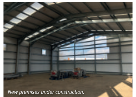
New premises under construction.