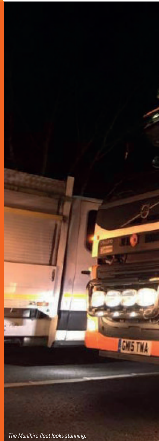
The Munihire fleet looks stunning.