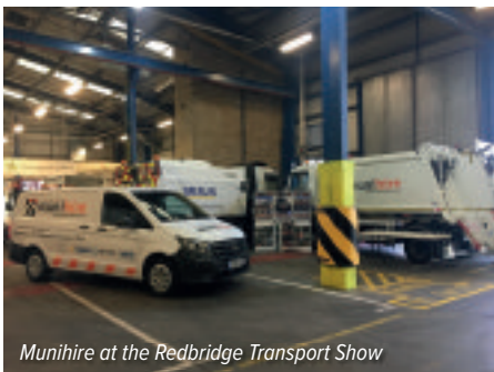
Munihire at the Redbridge Transport Show